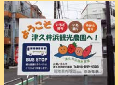
Free shuttle bus stop at Tsukuihama station

By Car: From Womble Gate head to the Mikasa Park entrance stoplight and turn right on Route 16. At the Honcho 1chome stoplight Turn left onto Route 26. Follow Route 26 and pass through Kinugasa Jujiro stoplight. Keep going straight on Route 26 until Kinugasa Inter Iriguchi stop light. Turn left at the Kinugasa Inter Iriguchi stoplight and go straight until Sahara Kosaten stoplight. At the Sahara Kosaten stoplight turn right onto Route 27. Continue on Route 27 and take a left at the Shimada Koen stoplight. Go straight until Route 134 and take a right at Nobieki Iriguchi stoplight. Continue on Route 134 and turn right at Tsukuihama Eki Iriguchi stoplight then continue until the farm entrance and advance carefully along the narrow road.